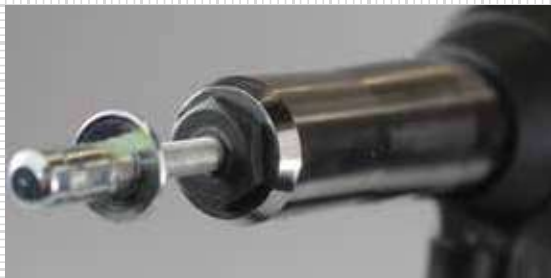
Eminently suitable for FERRO® BULB blind rivets!